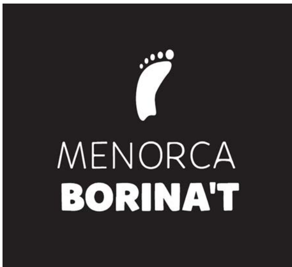
Figure 1 Program logotype.