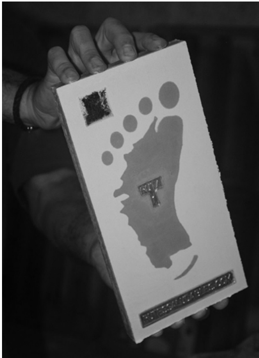
Figure 3 Program tile used to mark healthy routes in the island towns.