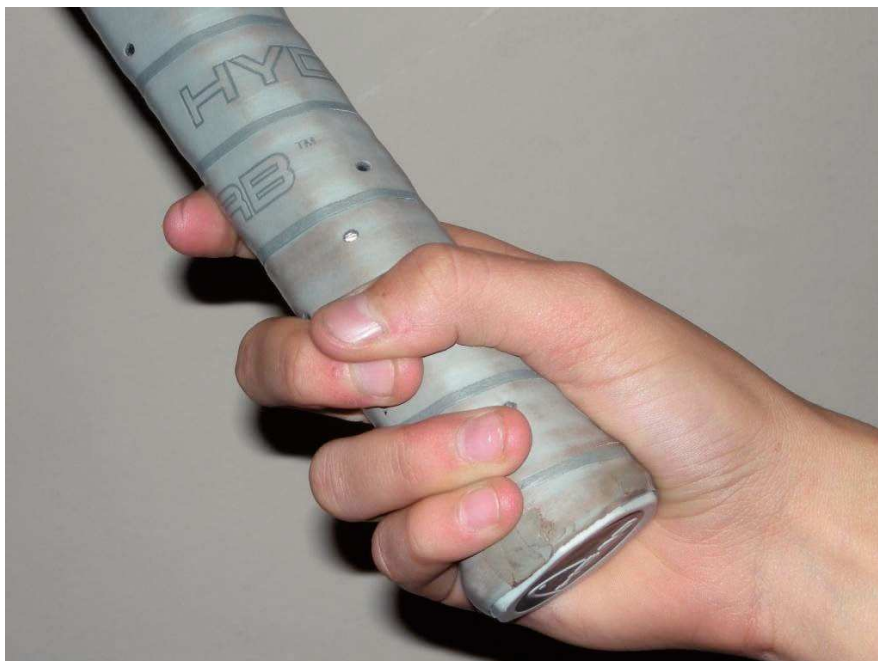
Figure 1 Image of the tennis racket grip.