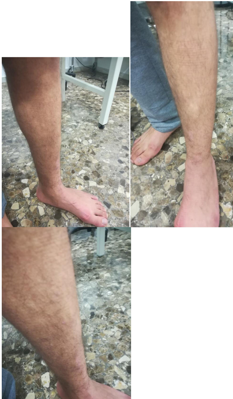
Figure 1 Visible mass standing and straining the leg muscles approximately 2 cm, seen along the anterior aspect of the leg in its mid-part.

to confirm it. The differential diagnosis of muscle hernias includes varicosities, angiomas, arteriovenous malformation, lipomas, ruptured muscle (a pseudohermia) and soft tissue tumours. 4 However, these tumours do not show movement on changing the patient position. Dynamic sonography is diagnostic in detecting a myofascial defect and can confirm the diagnosis. Dynamic sonography can detect a muscle bulge through the fascial defect on muscle contraction and its retraction on relaxation. Sonography is advantageous