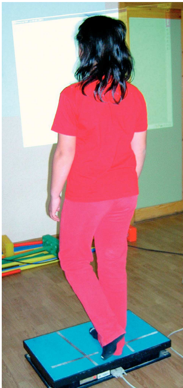
Figure 2 Single-leg balance test.

Balance test. Barefoot, the subject stands on the platform and places both feet on the marked lines. At a distance of 1.5 m from the platform, there are four targets that light up at random. The subject moves their centre of pressure (COP), as quickly as possible, with arms at the sides, towards the target and remains at the target until the next target lights up. The test lasts for 40 s.