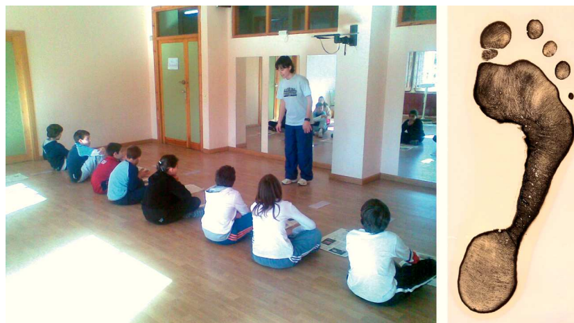
Figure 1 Taking the footprint by means of photopodogram.

FFM: fat free mass; BMI: body mass index; n: number of subjects.