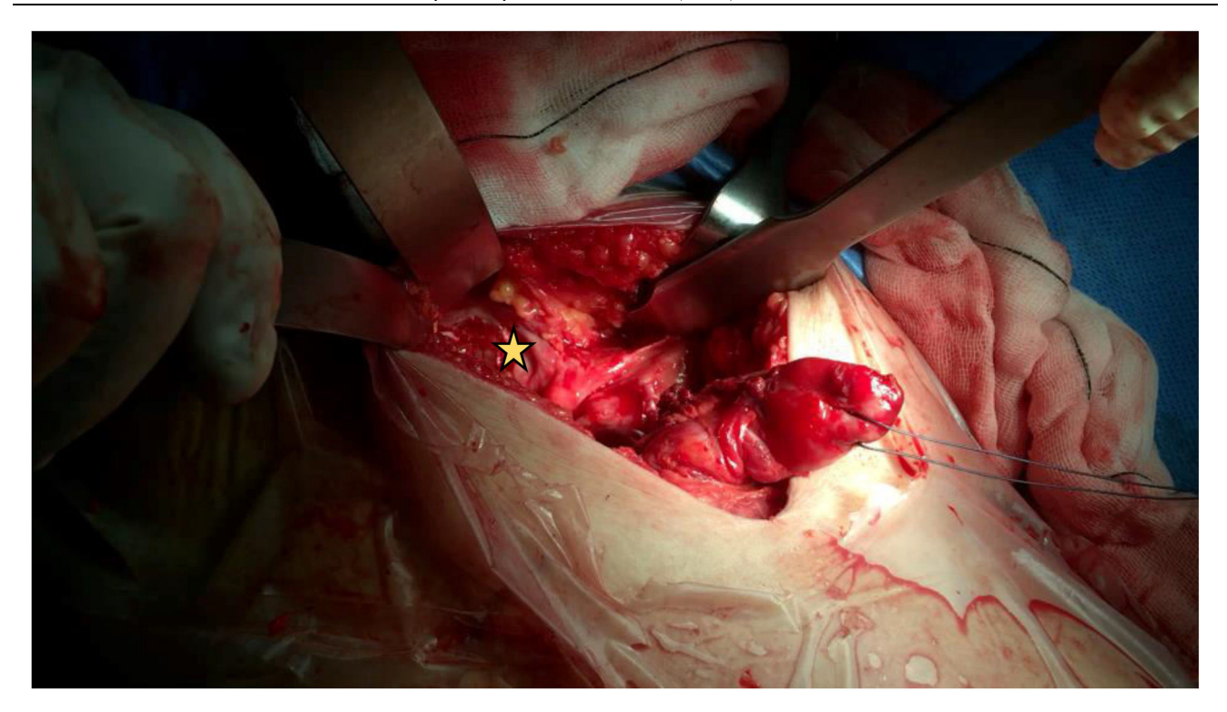
Fig. 4 Insertional footprint. The release of the stump allows sufficient mobilization for its anatomical reanchoring in the ischial footprint, previously debrided (star).

outcomes in athletic patients of advanced age and chronically injured, allowing them to recover their quality of life.