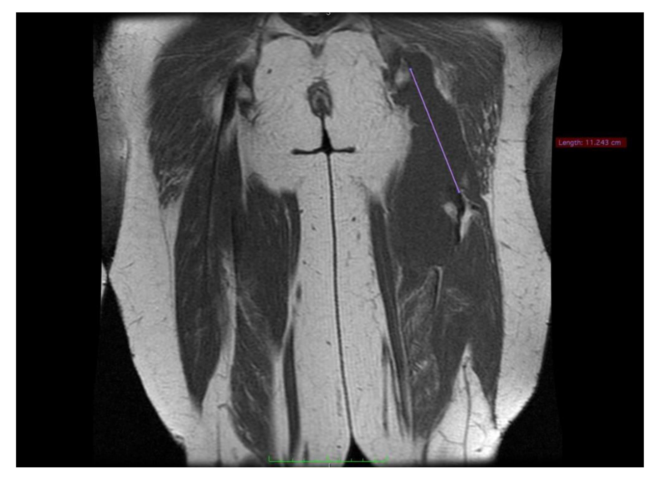
Fig. 1 MRI demonstrating proximal avulsion of the hamstring tendon with an approximate retraction of 11cm.

measured in kilograms (Fig. 5a and b). In addition, an explosive strength test was performed using a digital power scale (Enraf-Nonius - \bigcirc ), measured in Watts, consisting of 2 series of 8 reps with progressive weight load (Fig. 6a and b).