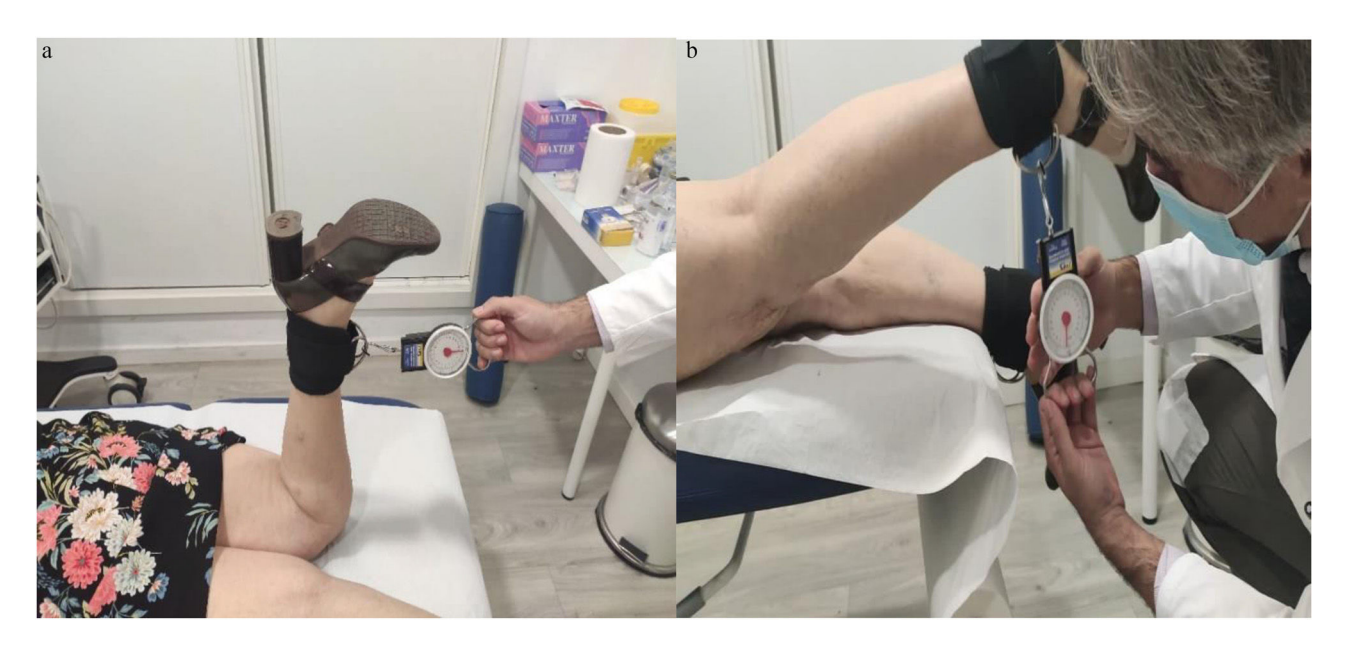
Fig. 5 (a, b) Manual dynamometer test. Contraction at 90° of flexion and in full extension.

Systematic reviews have been published in the literature recently with satisfactory results after surgical treatment of this pathology. These studies focus the surgeries on middle-aged patients who practice sports activities regularly. Hillier-Smith et al.,<sup>7</sup> in their review of 1530 patients treated surgically, present a mean age of 44.7 years, which is similar to other systematic reviews with ages of 39.7^{13} and 41.4.^{6}