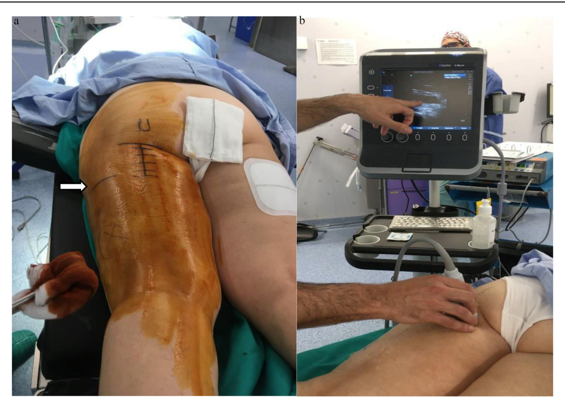
Fig. 2 (a, b) Surgical incision. Note the ultrasound marking of the retraction level of the stump (white arrow).

In the explosive strength test with digital scale, when compared with the contralateral leg, a mean of 99% of strength measured in Watts was obtained (range 50–180%, p = 0.513) (Table 4).