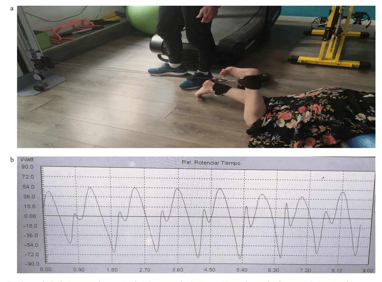
Fig. 6 (a, b) Explosive strength test using digital power scale. Patient position and example of power scale in series of 8 repeats.

However, in our case we are dealing with older patients (mean age 61 years) with less sporting activity, who are usually underdiagnosed or ruled out for surgery for these reasons. All of them had disabling functional symptomatology, so conservative treatment was not a viable option in these patients.